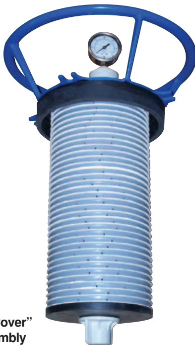
“Unitized Pack/Cover” PVDF Disc Assembly